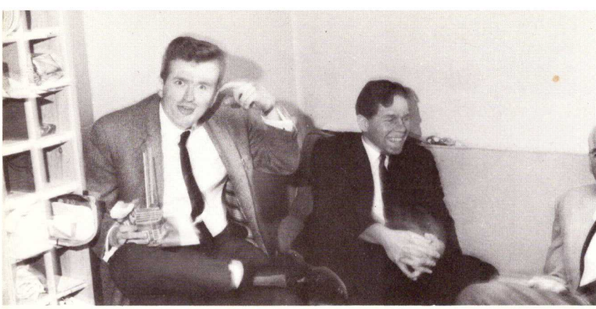
In my spare time, I teach