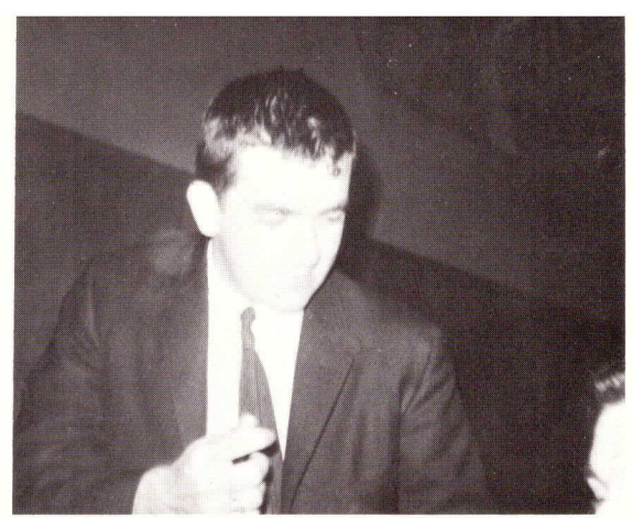
It's my Teddy Bear!