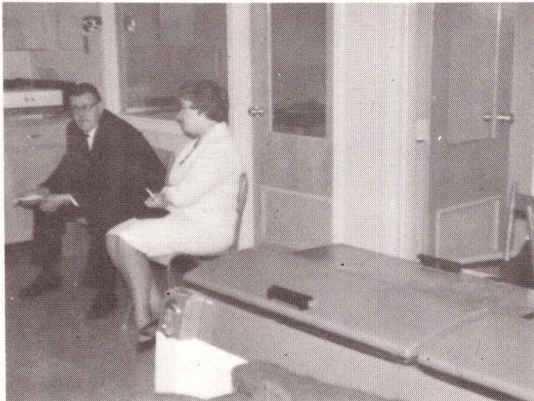
Do we have to go on meeting this way!